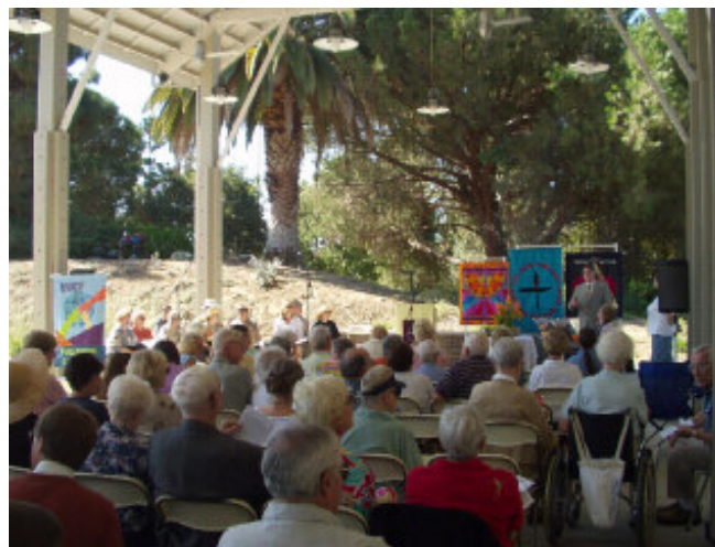
Sept. 24 th Service at Fullerton Arboretum