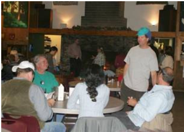
Parents got to relax, too!